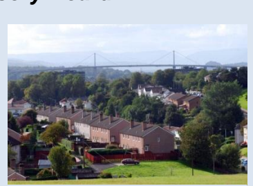
A community in West Dunbartonshire

West Dunbartonshire Council has established a Strategic Advisory Board. The overall objective of the Board was to create a Vision for West Dunbartonshire in 2020 and recommend to the Council 'game changing' projects that would achieve a better future for West Dunbartonshire people. These objectives need to clearly align with the Council objectives and those of the Single Outcome Agreement. The Strategic Advisory board was made up from successful individuals from the public and private sector to act as 'critical friends' of the