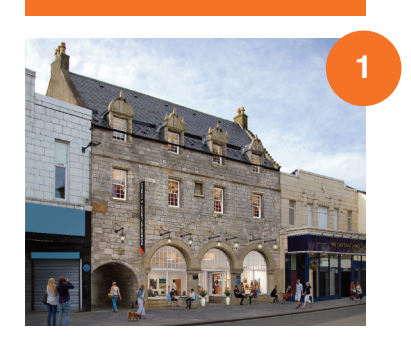
PHASE 1 - GLENCAIRN HOUSE This historic building would become the new home for a first-class Library and Museum for Dumbarton