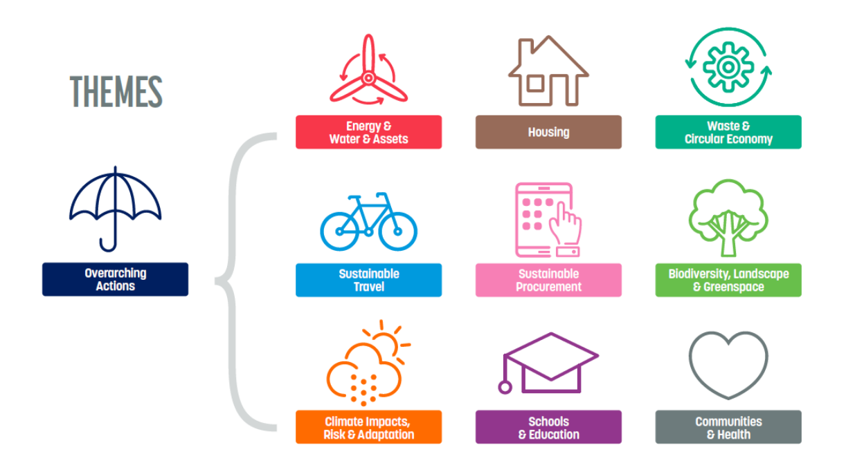
Exhibit 12 Climate Change Action Plan – 10 key themes to address climate change