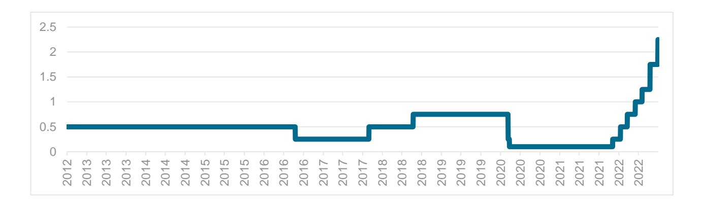
Exhibit 7 Bank of England base interest rate since 2012