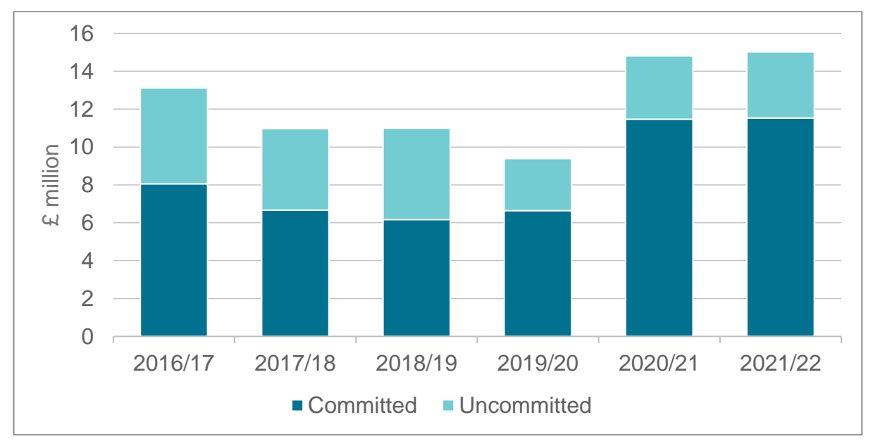
Exhibit 10 Analysis of the general fund balance over past five years