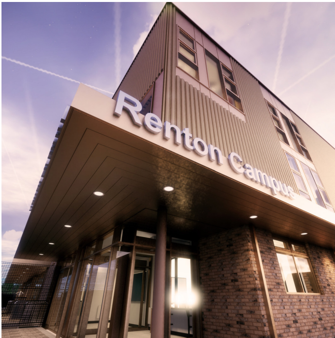
Progressed construction at Renton Campus