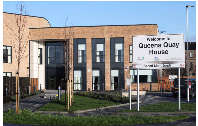
Opened new care home, Queens Quay House