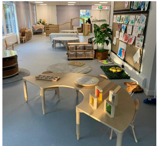
Created new Early Learning and Childcare Centres across West Dunbartonshire