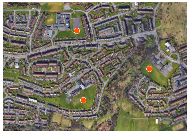
Secured funding for Faifley Education Campus