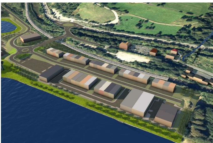
Secured planning permission for a major development in Bowling